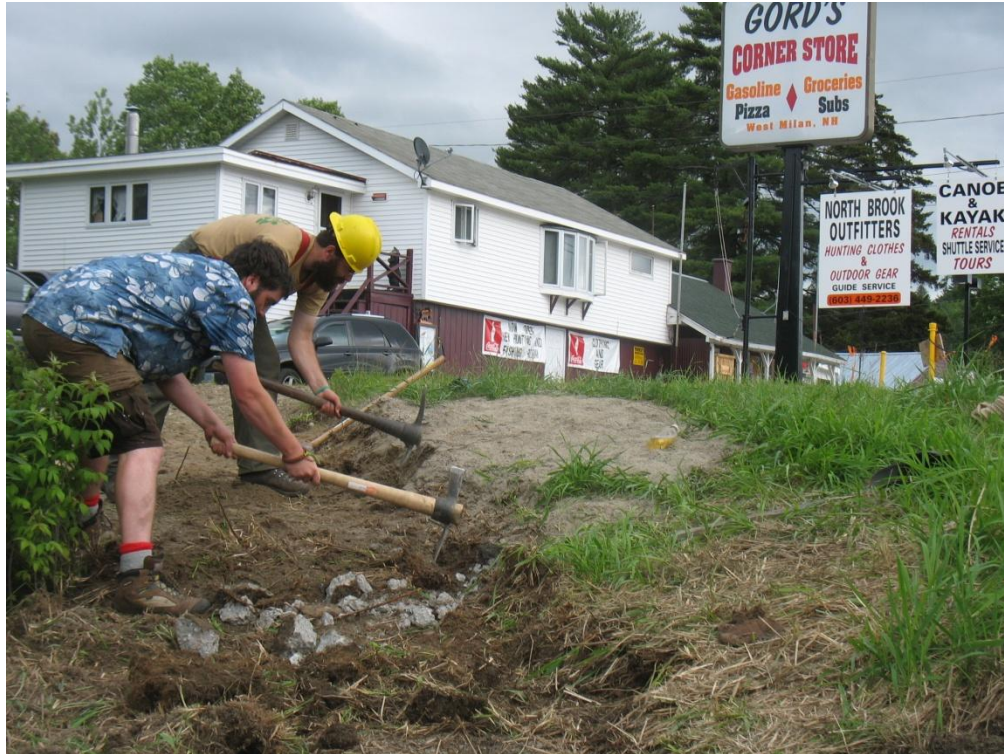
NFCT Stewardship Crew Members working on Gord's Access.