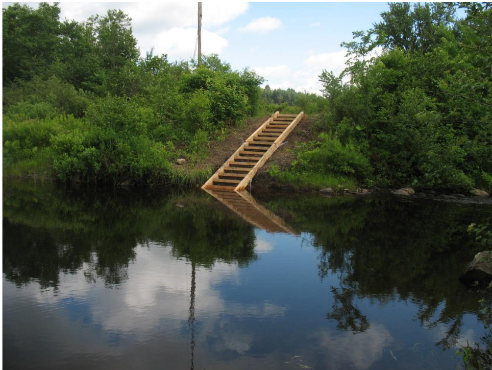
Gord's log ladder access.